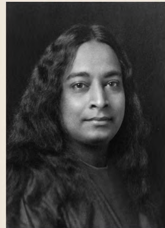
Paramahansa Yogananda, Founder, Self-Realization Fellowship

HELP MAKE OUR GURU'S BELOVED INDIA HALL ACCESSIBLE TO ALL!