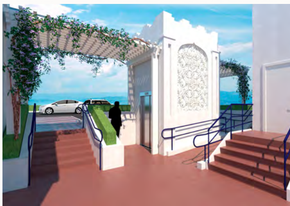
New View from Temple Grounds: Schematic Design of Elevator and Foyer