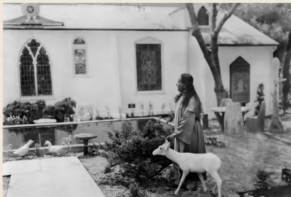
Paramahansa Yogananda in front of Hollywood Temple